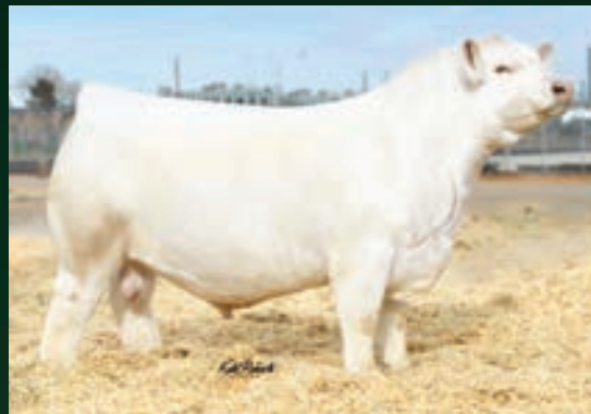
PCC BOURBON 118J // LOT 10B SIRE