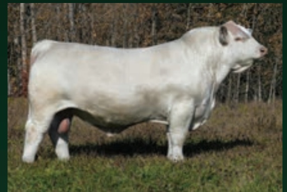
WGD RUGER 8J // LOT 5C SIRE