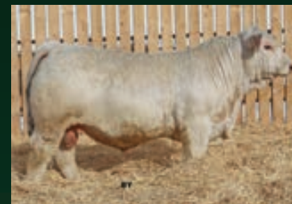
ELDER'S HOULIO // LOT 4D SIRE