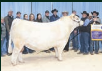
SVY MAYFIELD 30H // LOT 4A SIRE

GUARANTEE ONE PREGNANCY PER PACKAGE OF THREE.