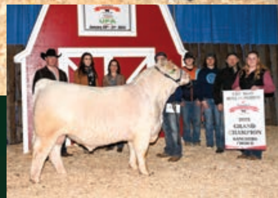
SOS KICKSTART PLD 825K // SON