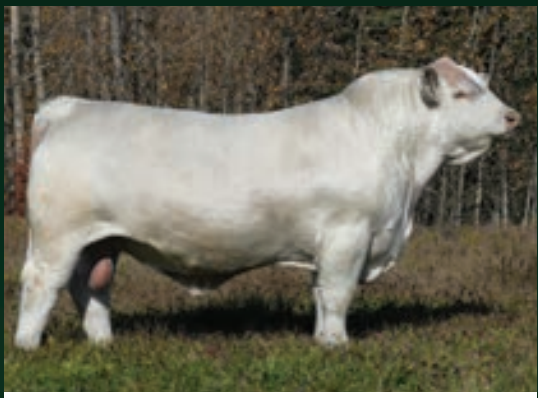
WGD RUGER 8J // LOT 3C SIRE