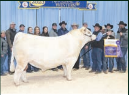
SVY MAYFIELD 30H // LOT 3A SIRE

- The dam of SOS Apex , the 2018 Players Club Champion, herd sire for us at Springside and making a name for himself! - Sold in our Season Finale Sale for $25,000 to KG Land and Cattle - Lot 3A is sired by the 2022 CWA Supreme and 2023 US National Champion Bull - 3B embryos are full siblings to SOS Apex Pld 139F - 3C is sired by the high selling and Agribition Reserve Champion Bull Ruger. Embryos are stored at Davis-Rairdan Embryo Transplants Ltd. Consigned with KG Land and Cattle