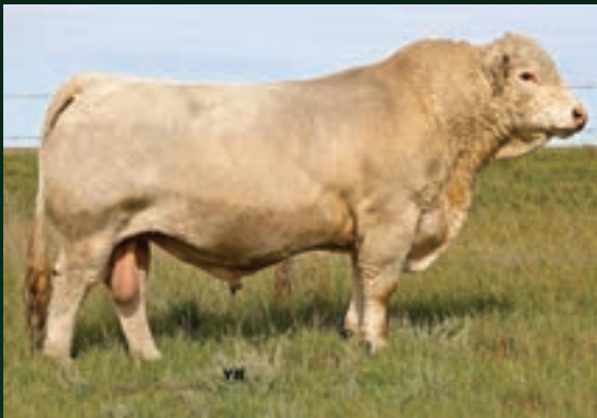
TURNBULL'S DUTY-FREE 358D // LOT 5A SIRE

Embryos are stored at Bow Valley Genetics Ltd.