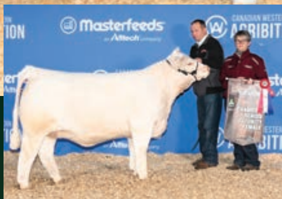
SOS HEARSTRING 393K // $45,000 DAUGHTER