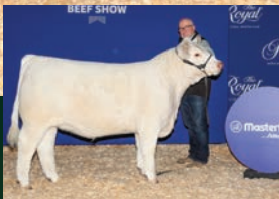
SOS HEARTSTRUCK 813K // $15,000 DAUGHTER