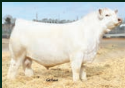
PCC BOURBON 118J // LOT 4B SIRE