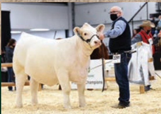
SOS DESIRAE PLD 141J // DAUGHTER