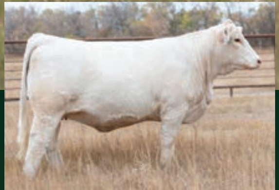
SOS GODDESS PLD 21G // DAUGHTER