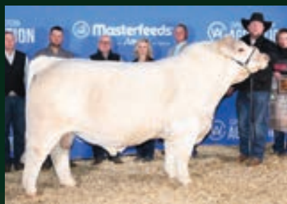
WGD RUGER 8J // LOT 4C SIRE