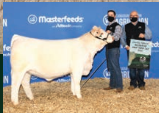
SOS DESIRAE PLD 141J // DAUGHTER