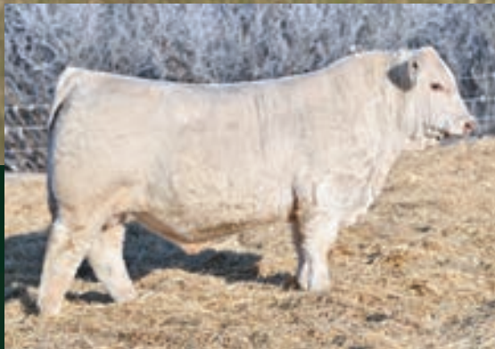
KG TRUE GRIT 1K // SON