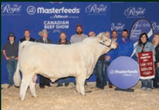
SOS TIMBER PLD 88J // LOT 10A SIRE