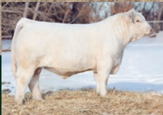
SOS HEFNER PLD 33H // SON