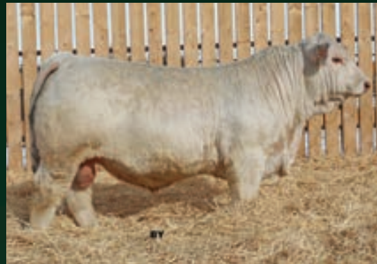
ELDER'S HOULIO // LOT 5B SIRE