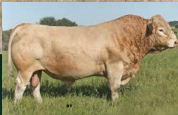
ERIXON'S SPITFIRE 127T // SIRE