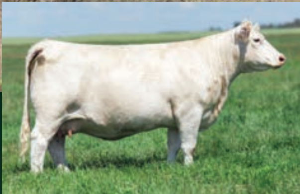
MXS NORTHSTAR MAID 531C // DAUGHTER