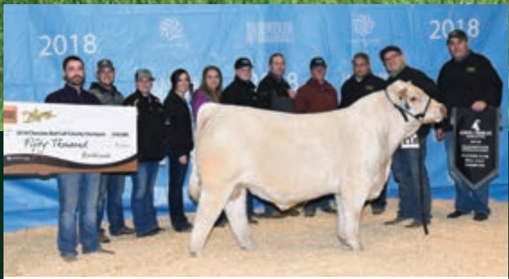
SOS APEX 139F // FULL BROTHER TO LOT 2B EMBRYOS